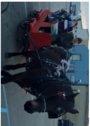
Sleigh rides by Kniebes Farms (weather permitting) - sponsored by the Baroda Area Business Association