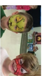
Face Painting sponsored by Chemical Bank in Baroda

If you would like to help out either with decorating, or at the event itself, please call the Village Office at 422-1779! We would love to have you be a part of this great community event!