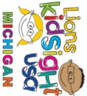
Lions International will be here to do vision screening for all the children