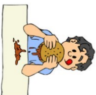
Light supper provided by The Baroda Village Council